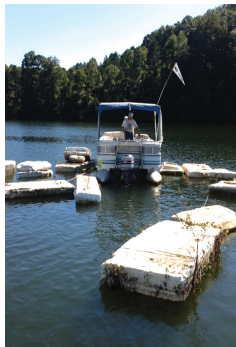
Super Volunteer – Ed Carruth – single handedly brings in several pieces of Styrofoam for proper disposal at Shore Sweep.

We have so many great volunteers that do so much to make Shore Sweep a success, it is really hard to single out any one person that did more than anyone else. With that said, we do want to highlight an example of the one of many Super Volunteers we have at Shore Sweep. For Shore Sweep 2013, LLA member Ed Carruth of Dawsonville made 200 wood stakes from previous Shore Sweep salvaged wood. He also fabricated a nail fastener for encapsulated Styrofoam. Prior to Shore Sweep day, Ed participated in scouting of the shore line for trash location. He also created “Volunteers Needed” signs and placed the signs at various locations around Dawsonville. Ed picked up 20 large pieces of Styrofoam in advance of Shore Sweep, and then,