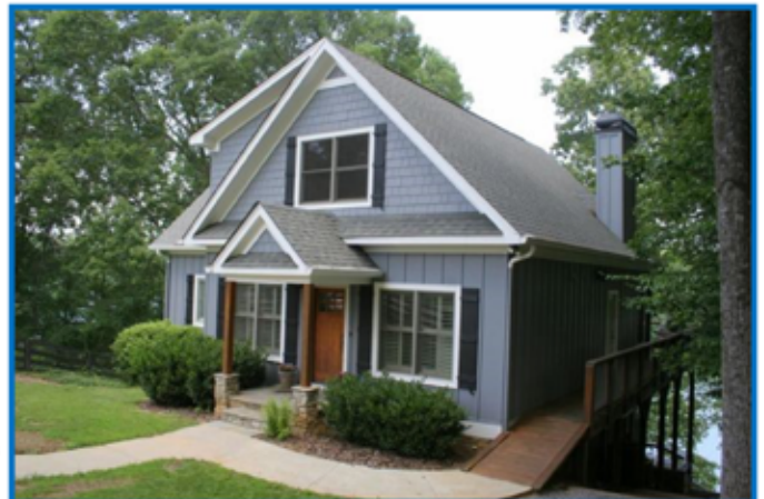
3141 Simpson Park Rd, Gainesville, Sold $760,000