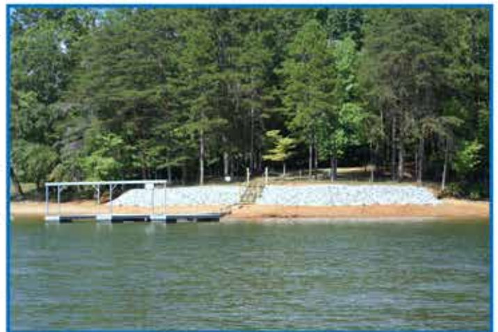
3994 Smallwoods Dr, Gainesville, Sold $499,000

#6 UPDATING AND HOME MAINTENANCE IMPORTANT FOR TOP RESALE VALUE: In the hot market prior to 2007, buyers were content purchasing homes in all price points prepared to remodel and even fix issues. The era of the weekend warrior paid off for investors. Property values were going up rapidly and buyers knew they could recapture their investment quickly. The next generation of lake buyer is much more interested in lifestyle and ease of transition, as well as resale value. Their first choice when purchasing will be a home lovingly maintained and with updates such as modern kitchen, bathrooms, decks, roofs and systems if needed.