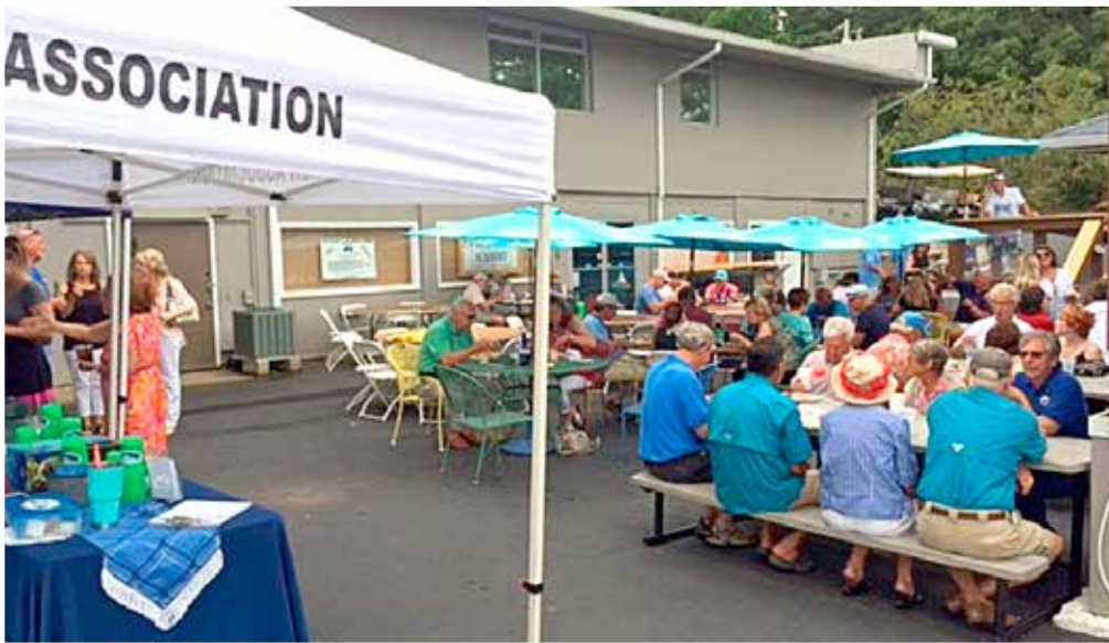
A great crowd turned out for the Member Social at Twisted Oar/Holiday Marina on Saturday, July 15, 2017. Delicious low country boil served up by Twisted Oar.