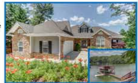
8950 Fields Way, Gainesville, Listed at $869,000

#3 SECOND HOMES ON THE RISE: Buyers of all ages are heading to Lake Lanier for refuge from the "Concrete Jungle" of Atlanta, or as an escape from crowded beach towns or cold weather locations. With shopping and modern conveniences readily available now, our second home residents can enjoy all that our communities have to offer year-round. These buyers are looking for deep water boat dockage, and well-maintained and updated properties that they can move into with little or no renovation. Second homes are selling from the $250's up to $1,800,000 this year.