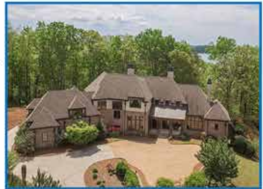
4882 Cook Rd, Gainesville, Pending Sale $1,200,000

#1 A HEALTHY AND VIBRANT MARKET: With lake home prices nearing 2006 levels again, and inventory 30%-40% down depending on price segment, home sellers are enjoying a steady market with prices edging up about 5% this year. Those sellers with deep water are clearly winners with low water properties patiently holding off the market until a full pool returns. Buyer activity is high, but with low inventory, it can be frustrating Buyers to find a home that fits their needs. Homes under $500,000 are in high demand with less than 45 days on the market and we are seeing multiple offers and just days on the market for hot properties. Lake lots are selling again, prices ranging from the $200's in multi slip communities up to luxury lots from the 400's up. Our group just sold a lake lot in Cumming for $800,000 this month. According to Mary Thompson, Lake Lanier appraiser, this is the most expensive lot sold in years. We have seen a few tear downs for more.