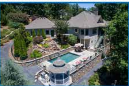
4883 Propes Dr, Gainesville, listed at $1,395,000

#4 OUTDOOR LIVING SPACES: Home owners are seeking outdoor living spaces more than ever. Whether you have a wooded or water view, enjoying nature and entertaining outdoors is something we all want more of. Swimming pools are in big demand. Elaborate stone outdoor patios, covered porches, outdoor kitchens, stone fireplaces and hot tubs are sought after. Those lucky enough to be close to the water are building outdoor pavilions & covered patios to get closer to the lake. Properties with an outdoor amenity enjoy less time on the market and more resale value.