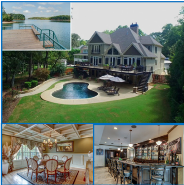
6010 Chimney Springs Rd, Buford Sold $1,250,000