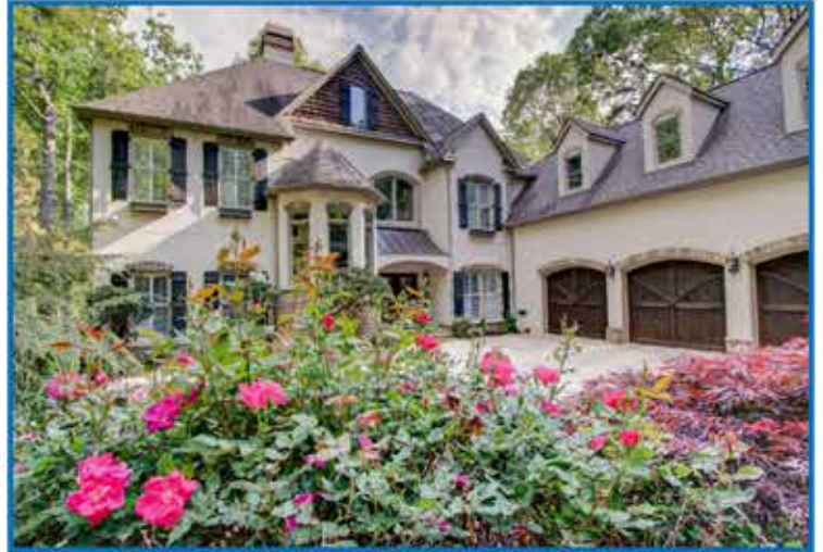
5337 Bay Circle, Cumming, Listed for $1,295,000

#5 LUXURY LAKE SALES LOOKING UP: Luxury home sales over $1 million dollars are up 20% over the last 12 months in number of sales. Low interest rates and improving economy are helping this segment of the market to improve, regardless of water levels and low inventory. There are currently 50 homes now on the market over $1 million. Twenty homes have sold, and pending sales are up. Fifty percent of these sales are cash buyers, and about half are second homes. The average million-dollar lake home has 4-6 bedrooms and 5 baths with an average of 5500-8500 square feet. The average sales price in 2017 is $1,250,000 with an average of 90% sales to list price ratio. According to Mary Thompson, of Lake Lanier Appraisal Service, "Values steadily increasing about 1.5% year for homes priced $899,000-1,299,000 and values are up 8% for homes sold above $1,300,000". About 75% of luxury homes sold have pools and most have screened porches or outdoor living spaces. The luxury homes sales are split evenly between south and north lake locations, with the majority in Hall County this year due to low inventory in other counties.