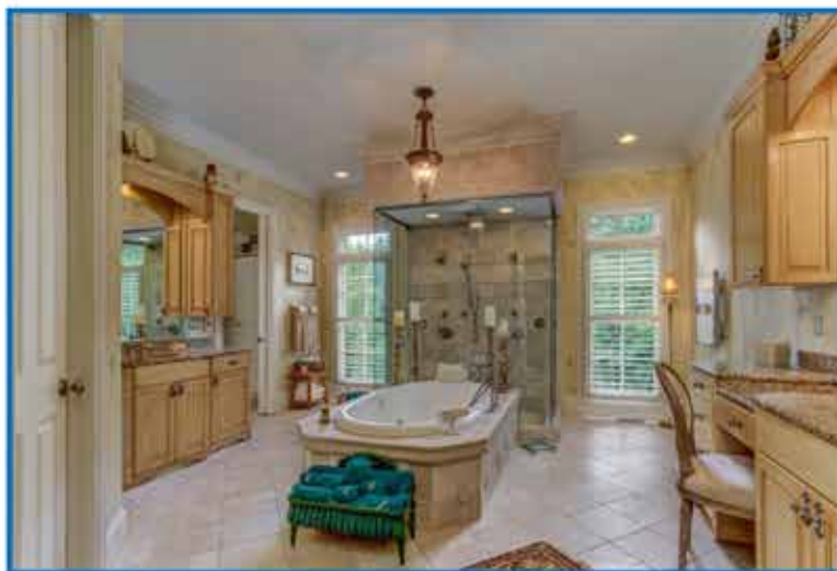
9085 Bethel Rd, Cumming, Sold $2,050,000

#7 DRESSING UP THE SHORES: With water quality and erosion control always an important topic, we are seeing more homeowners and businesses taking a proactive stance. Just take a cruise on the lake and you will see homeowners lining the shoreline with granite rip rap stone. We are receiving the benefit of a beautiful shoreline while also receiving the shoreline protection Lake Lanier is sorely in need of. Additionally...Old docks are gradually being removed or refurbished, with newer, more attractive and safer docks appearing in their places. Owners with newer and well-maintained docks will also receive some benefits of a higher price at resale.